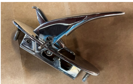
Rivet attaching the handle to the base plate.