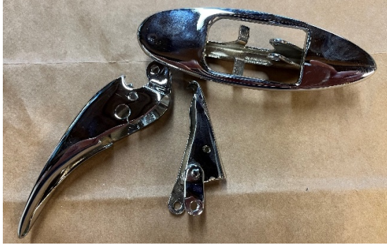
Freshly chromed parts.