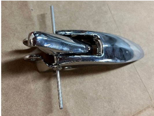
Closing finger riveted to the handle.