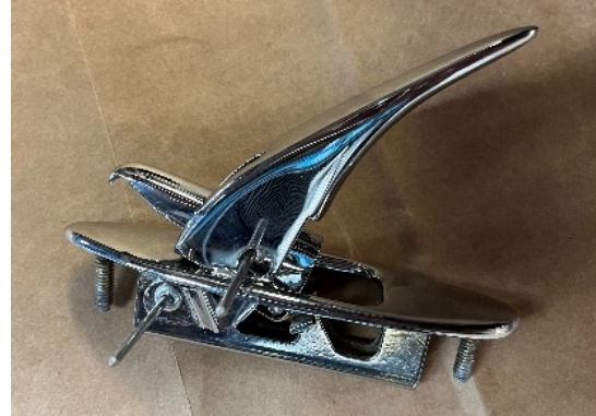
Both handles attaching the handle to the base plate.