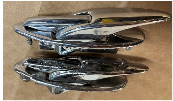
Finished rear soft top latch with unrestored latch below.